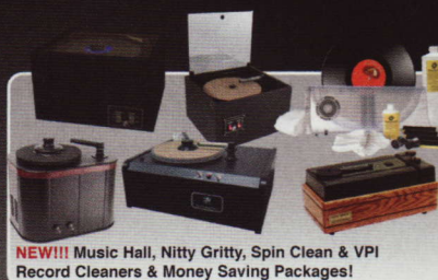
NEW!!! Music Hall, Nitty Gritty, Spin Clean & VPI Record Cleaners & Money Saving Packages!