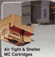
Air Tight & Shelter MC Cartridges