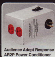
Audience Adept Response AR2P Power Conditioner