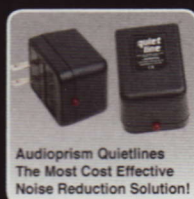
Audioprism Quietlines The Most Cost Effective Noise Reduction Solution!

This Norwegian powerhouse (375Wpc into 8 ohms) combines the bass control and dynamic impact of a dreadnought design with a midrange and treble refinement, delicacy, and sweetness reminiscent of a single-ended triode amplifier. The midrange, in particular, is highly vivid and present, with a palpability and directness of expression RH has not heard in an amplifier near the H30's price. RH, 223