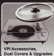
VPI Accessories, Dust Covers & Upgrades