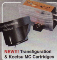
NEW!!! Transfiguration & Koetsu MC Cartridges