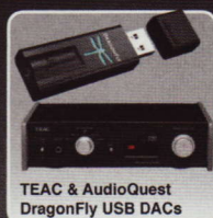
TEAC & AudioQuest DragonFly USB DACs