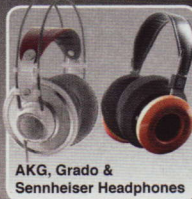
AKG, Grado & Sennheiser Headphones

MUST HAVE GEAR & ACCESSORIES! Cartridge Trade-In & Package Pricing Available!