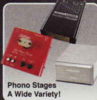
Phono Stages A Wide Variety!