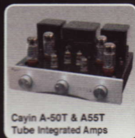
Cayin A-50T & A55T Tube Integrated Amps