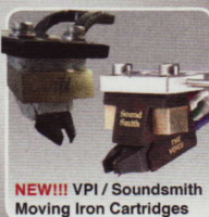
NEW!!! VPI / SoundSmith Moving Iron Cartridges