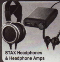
STAX Headphones & Headphone Amps