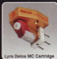
Lyra Delos MC Cartridge