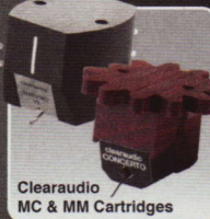
Clearaudio MC & MM Cartridges