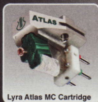
Lyra Atlas MC Cartridge